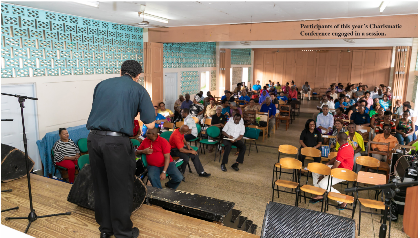
Participants of this year's Charismatic Conference engaged in a session.