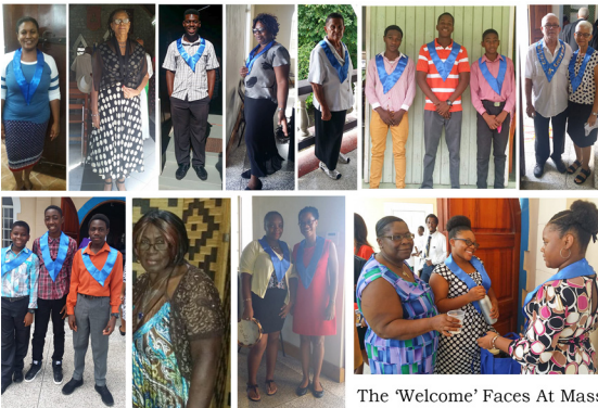
The 'Welcome' Faces At Mass